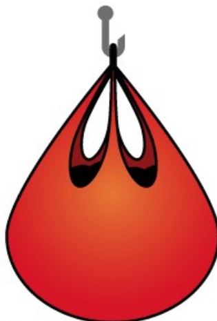
2 Gather tarp loops for easy lifting